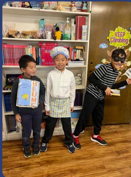
Book, Cook, and Crook