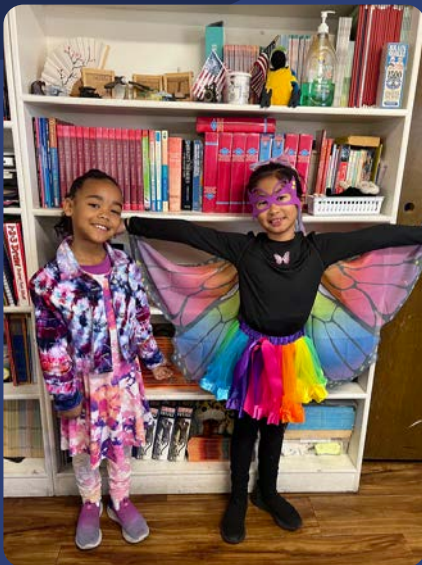
Tie Dye and Butterfly

Thursday, February 20, was Rhyme Without Reason Day. In a nutshell, two or more students pair up with each other wearing costumes that rhyme but otherwise didn't have much else in common. For example, cats and bats, referee and bumblebee, worker and teacher, and etc.