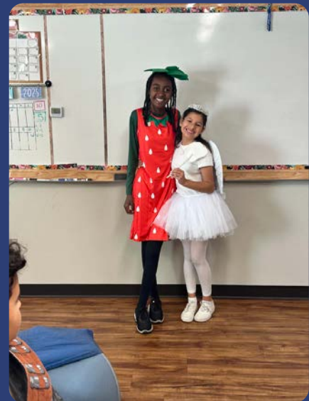
Strawberry and Fairy

Our students' creativity was nothing short of impressive, as they roamed the halls in the most unexpected yet cleverly rhymed outfits. From princesses and fitnesses to wizards and lizards, the day was filled with laughter, photo opportunities, and school spirit. Rhyme Without Reason Day truly showcased the humor and originality of the student body, and it became one of the most memorable highlights of Spirit Week. Teachers and staff joined in on the fun too, making it a whole-school celebration of wordplay and whimsy. The buzz of excitement was felt from homeroom to lunch, with everyone eager to spot the next punny pair strutting down the hall.