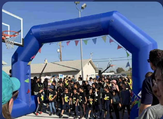
The elementary students excited and ready to run!