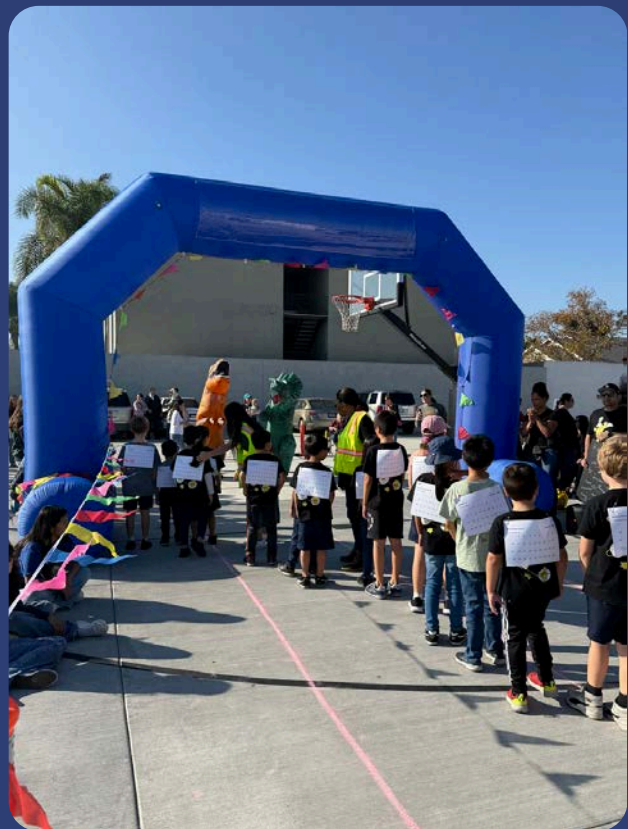
The elementary students lining up to run!

students hard work and a lovely picture with the entire school. It was extremely enjoyable and we hope to support them again next year