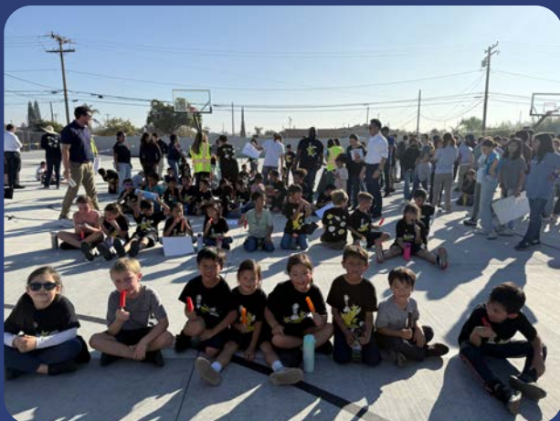
After their running, the elementary students enjoyed popsicles!